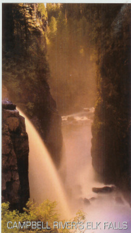
CAMPBELL RIVER'S ELK FALLS

Not surprisingly, eagles, too, were spotted on the nearby Storey Creek Golf Club on the following day's "skins" adventure. Dubbed "a course in nature," you might have to travel a million miles to find a course as tranquil, as un-urban, as supremely serene as Storey Creek. Every hole is a quiet amphitheatre unto its own. I love it. My 80-yard block slice is safe and secure here. It will not kill anyone or anything except, maybe, a crow.