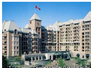
Hotel Grand Pacific has a lot of windows on Victoria's Inner Harbor.

VICTORIA, B.C. - The postcard outside your window is real. The blue water glimmers in the sun. Boats pull away from the dock. Floatplanes rise from the blue stuff into the sky. And people, lots and lots of people, stroll on by.