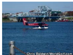
The drama of Victoria's floatplanes play out near Hotel Grand Pacific.

The views are part of what sets the Hotel Grand Pacific apart. This is one of those times when spending a little extra money for the harbor view (the Grand calls them Pacific Rooms) is worth it. These aren't Niagara Falls' far-off, "falls view" downer buys .