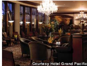
Hotel Grand Pacific gives you luxury in the heart of Victoria.

From there, it's an easy walk (almost everything in Victoria is) to all kinds of shopping and restaurants. Including plenty of hip spots where tea doesn't set you back 60 bucks.