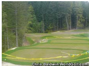
The yellow police tape keeps the deer off the new Valley Course's greens and tees.

He's not alone. Bear Mountain members and resort guests have been found wandering past all the construction signs and off-limit markers, just to sneak a little peak.