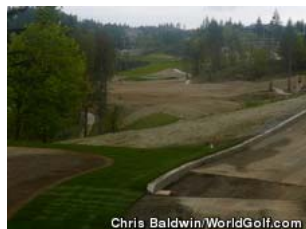
Bear Mountain Golf & Country Club's Valley Course features dramatic drops.