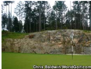
Valley Course has to live up to theatrics of Bear Mountain Golf & Country Club's original Nicklaus, the Mountain Course.