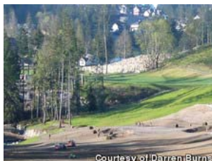
Bear Mountain Golf & Country Club's new Valley Course's 18 gives a sense of all elevation change.