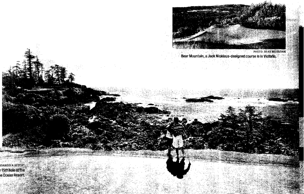
PHOTO: BEAR MOUNTAIN Bear Mountain, a Jack Nicklaus-designed course is in Victoria.