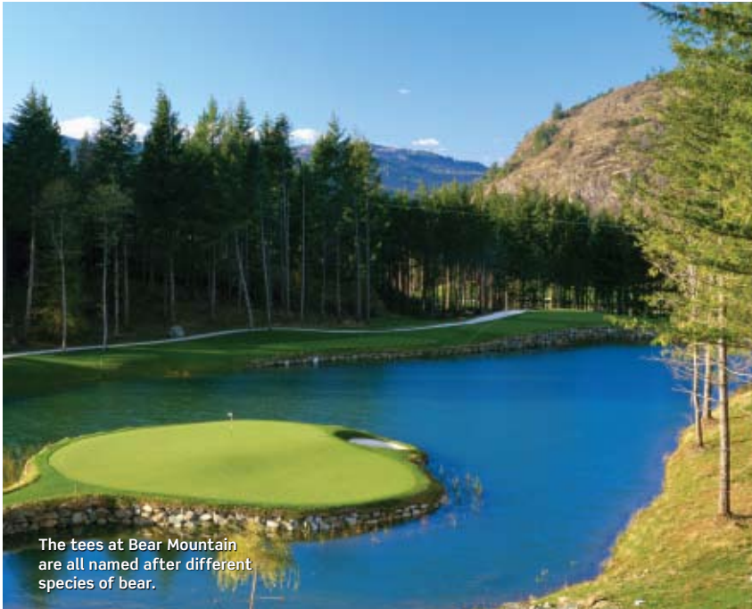
The tees at Bear Mountain are all named after different species of bear.