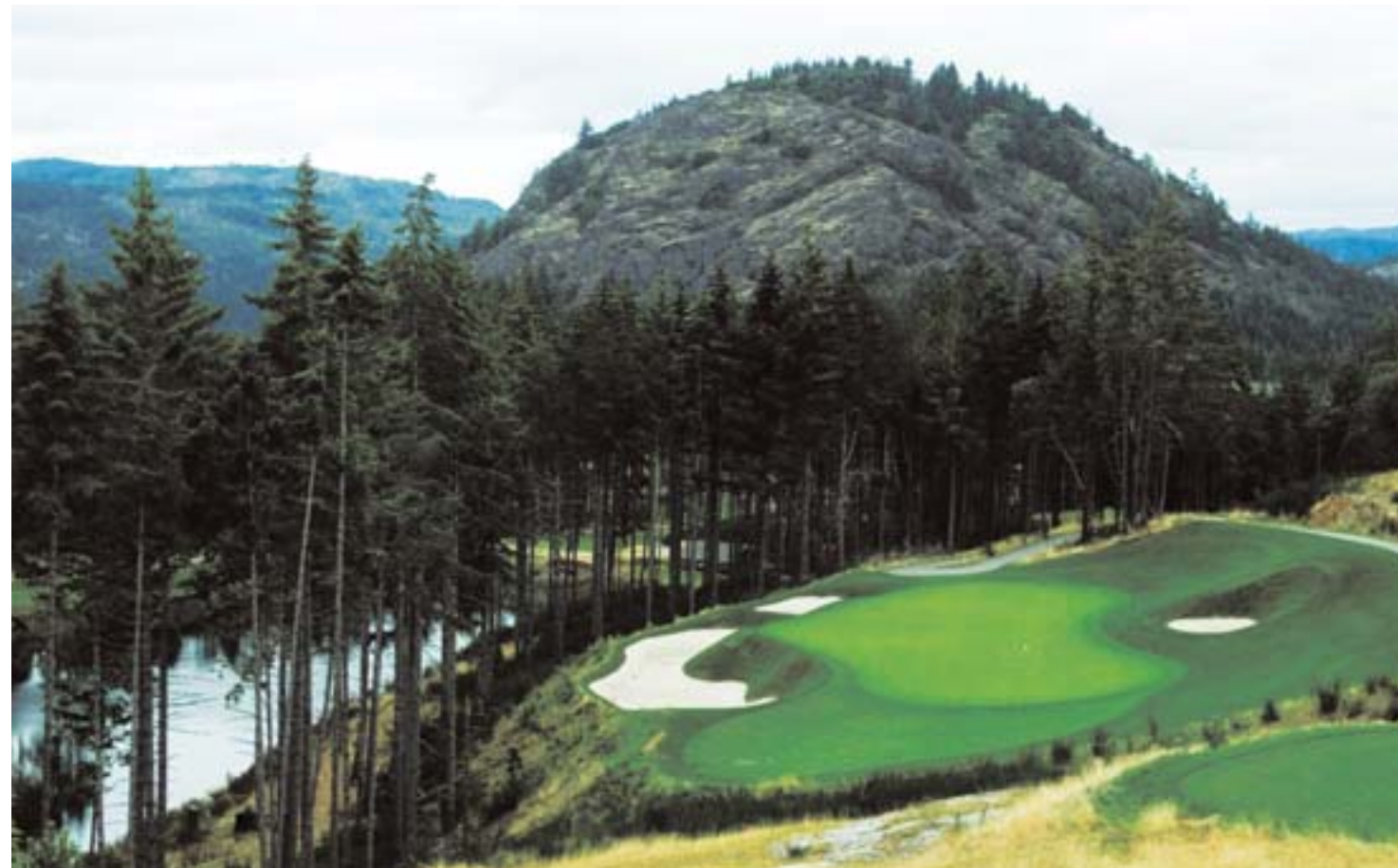
Bear Mountain Resort

It's a sunny mid-September morning in British Columbia. At precisely 8:30am the Whistler Mountaineer chugs gently out of North Vancouver railway yard, on its daily run to the alpine resort of Whistler, three-hours and 120-kms away, along a track with more twists and turns than an Agatha Christie novel. With our golf clubs stored safely on board we settle down in the first class Glacier Dome car – all white linens, waiter service and unobstructed views, and toast the trip with glasses of Okanogan bubbly while tucking into hearty cheese omelettes with Canadian back bacon – a tasty beginning to our week-long British Columbia golf journey by 'trains, ferries and automobiles', teeing it up on some of the best tracks around Whistler, Vancouver Island and Vancouver.