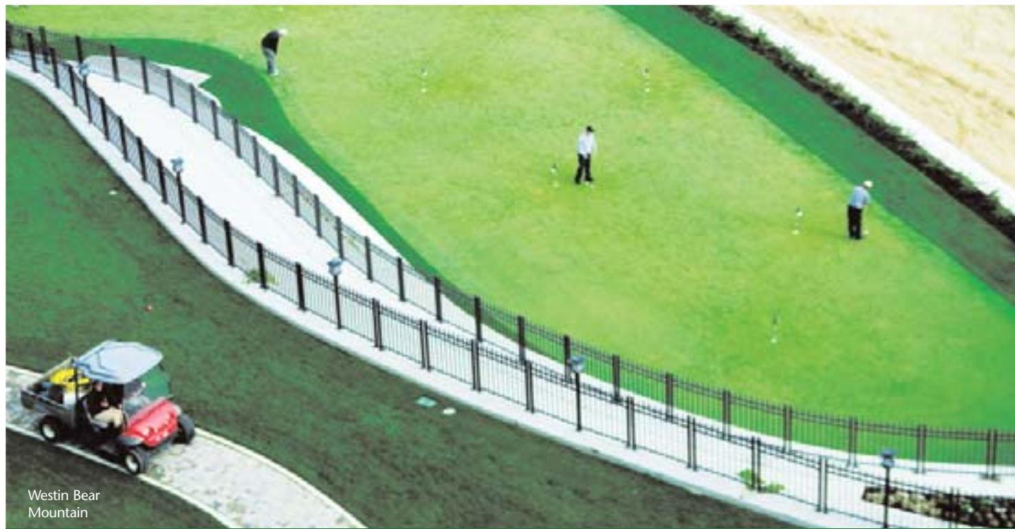
Westin Bear Mountain