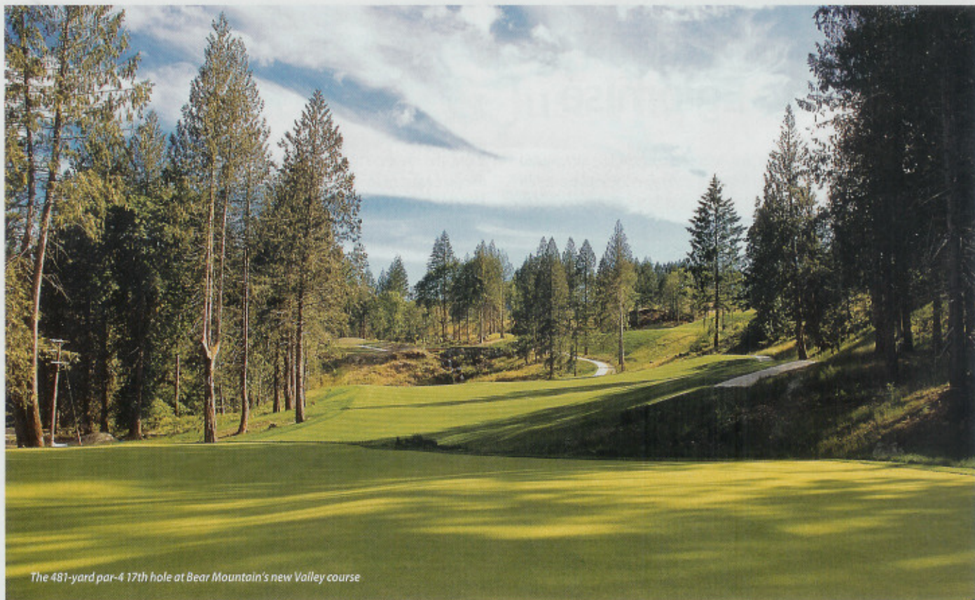
The 481-yard par-4 17th hole at Bear Mountain's new Valley course