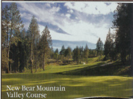
New Bear Mountain Valley Course

Save time and money on your custom golf vacation!