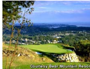
On the 19th hole at Bear Mountain golf course, right is bye-bye and left needs a miracle.

Interestingly, this hole was not originally seen by designer Jack Nicklaus and, consequently, was built as an encore after the fact. Jack, we applaud.