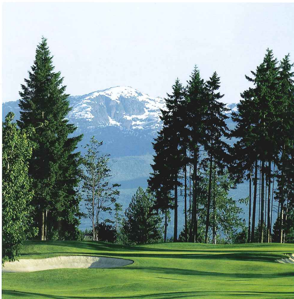
Above: Crown Isle Resort and Golf Community, Courtenay, British Columbia

Eagle Ranch makes use of its diverse terrain to create elevation changes on nearly every hole and has great vistas of the Selkirk Mountains. The 45 holes at Fairmont Hot Springs Resort offer something for everyone, but the most exciting course is Riverside, winding around and over the Columbia River,