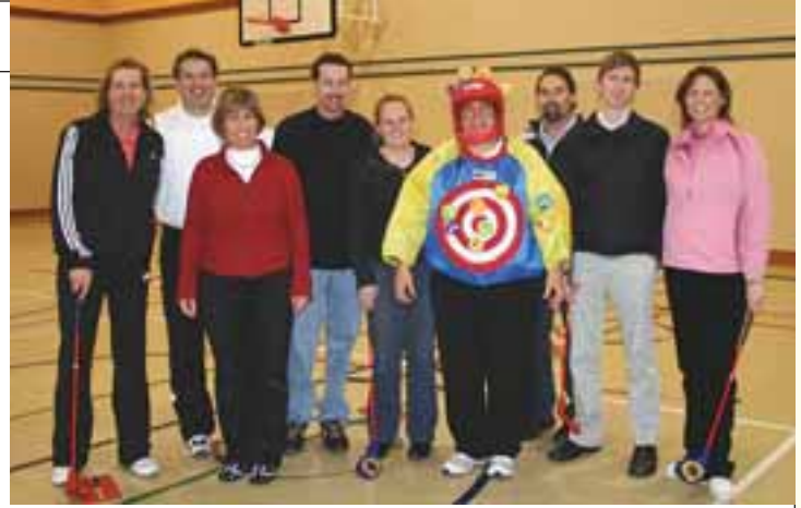
Three BCGA staff and six PGA Professionals attended the first ever SNAG workshop of the BCGA School Golf Program, the first of its kind in all of Canada.

The program will use SNAG as the primary teaching aid and this should address the issues of making golf fun and providing immediate success. SNAG is an