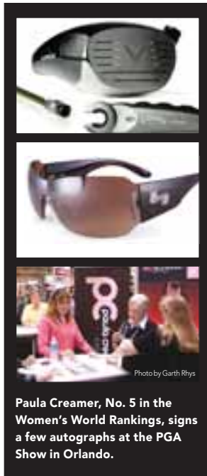
Paula Creamer, No. 5 in the Women's World Rankings, signs a few autographs at the PGA Show in Orlando.