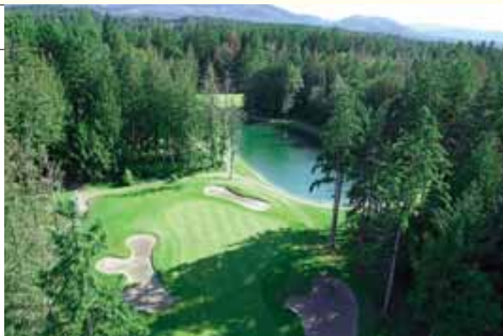
Hole #17, "One of the Top Holes on Vancouver Island"

Arbutus Ridge is known for offering the best vistas on Vancouver Island and friendly, genuine service. It opened in 1987 and is owned and operated by the GolfBC Group.