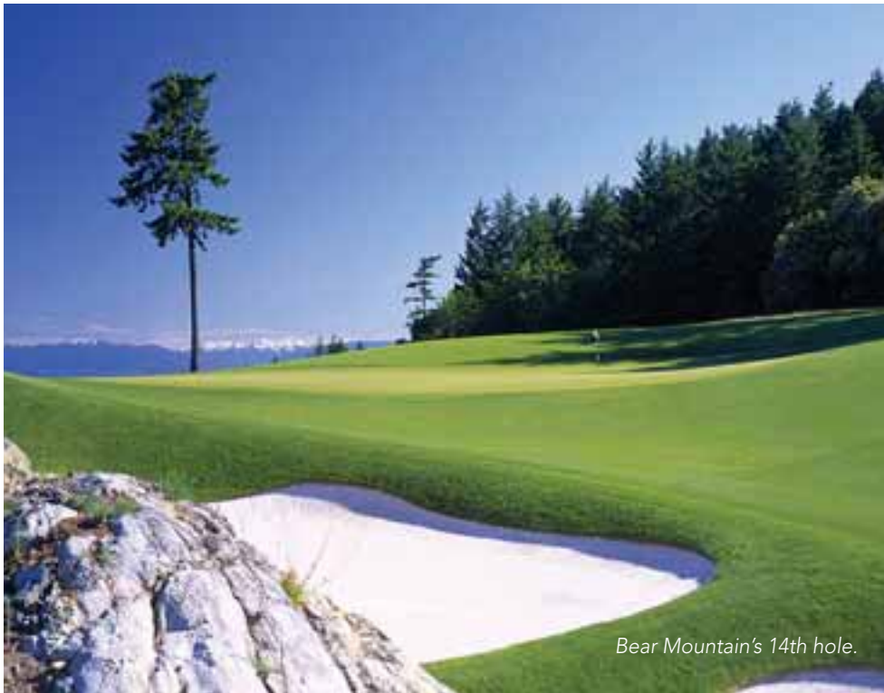
Bear Mountain's 14th hole.

"Vancouver Island specifically is a very, very dramatic backdrop, and people fall in love with it when they come here," Howe said.