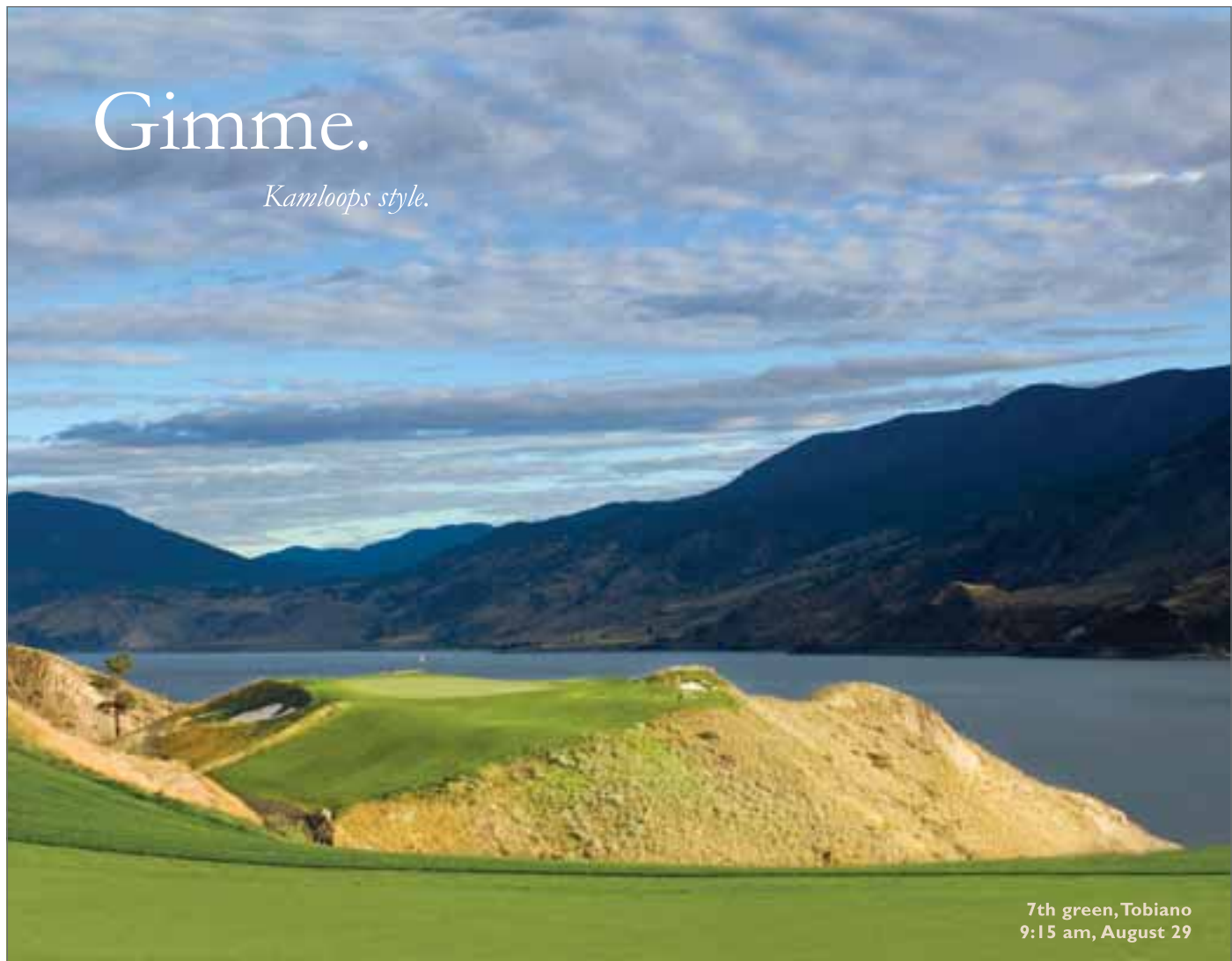
7th green, Tobiano 9:15 am, August 29