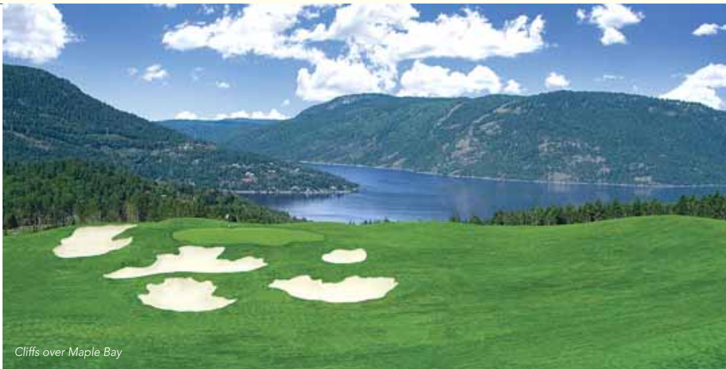
Cliffs over Maple Bay