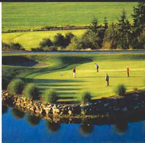
The 18th hole at Arbutus Ridge Golf & Country Club.