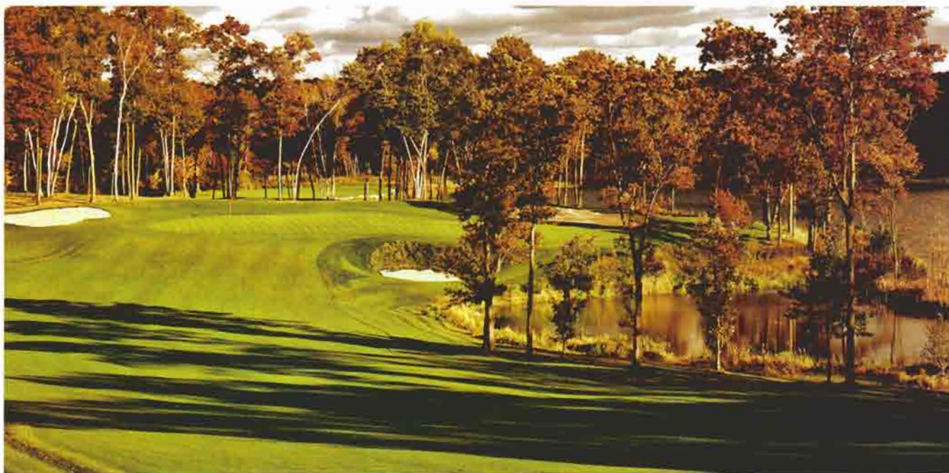
So close yet so far...from civilization (top to bottom): The Classic; two views of Olympic View