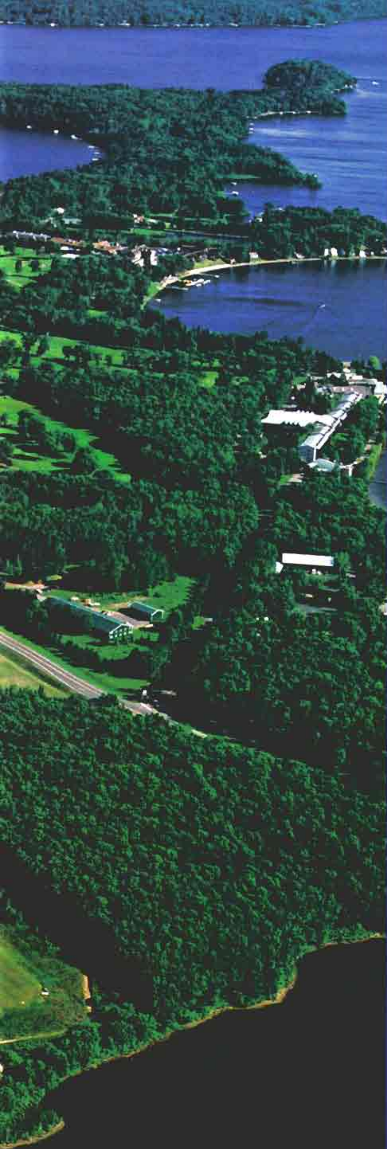
Madden's in Minnesota