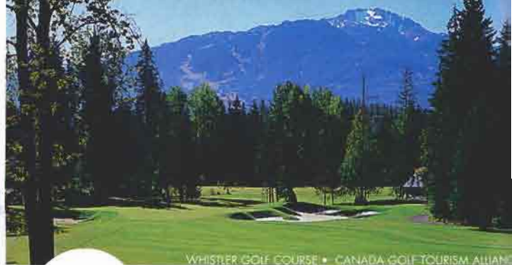
WHISTLER GOLF COURSE • CANADA GOLF TOURISM ALLIANCE