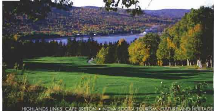
HIGHLANDS LINKS • CAPE BRETON • NOVA SCOTIA TOURISM, CULTURE AND HERITAGE