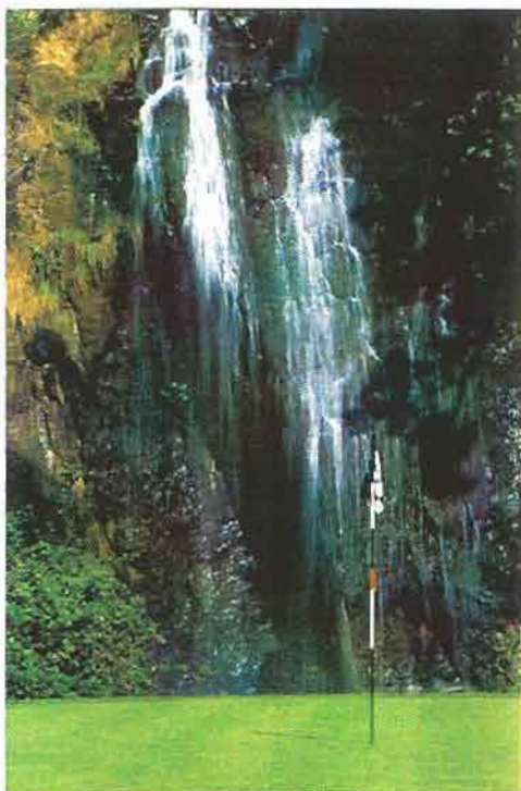
Heading for a fall: it can be hard to keep your mind on your golf game at Olympic View

Drive further north and you'll come across the resort of Whistler. Best known as a ski destination, it is also a busy, activity-packed town in the summer. Having