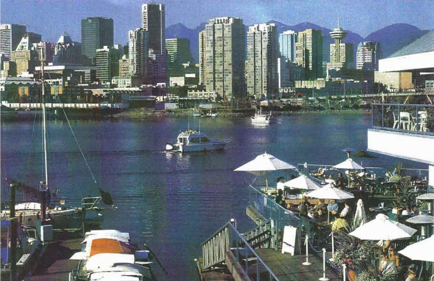
Above: the bustling harbour in Vancouver