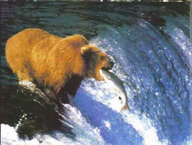
Right: Canada's wildlife is something to behold