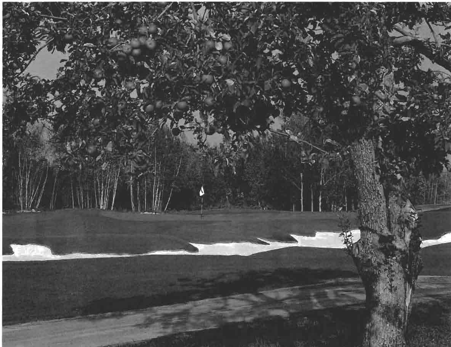
The Raven Golf Club at Lora Bay, Ontario Intrawest Golf