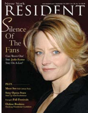
New York Resident