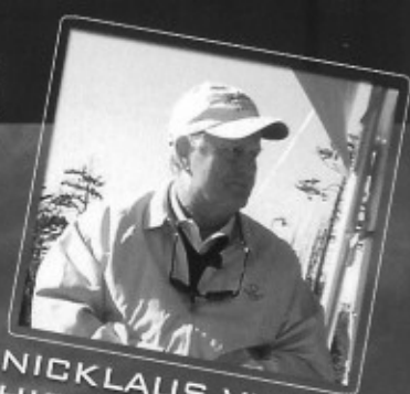
NICKLAUS VISITS HIS NEW DESIGN AT WYNDANSEA